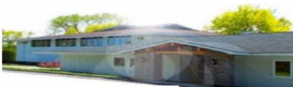
Director of Music

215 Blackberry Road Liverpool, New York 13090 Phone: (315) 652-6789 E-mail: uccbbery@twcny.rr.com